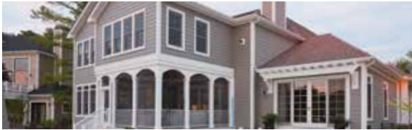
CELECT® CELLULAR COMPOSITE SIDING