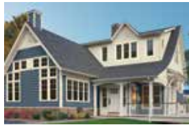
CRANEBOARD® SOLID CORE SIDING®