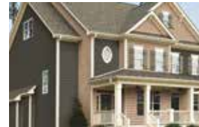
ROYAL® SHUTTERS, MOUNTS & VENTS