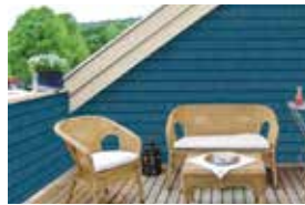
PORTSMOUTH™ SHAKE & SHINGLES