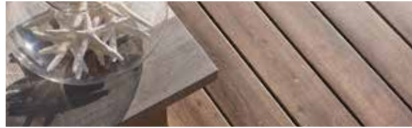
ZURI® PREMIUM DECKING